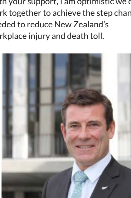
Minister for Workplace Relations and Safety, Michael Woodhouse

With your support, I am optimistic we can work together to reduce the step change needed to reduce New Zealand's workplace injury and death toll.